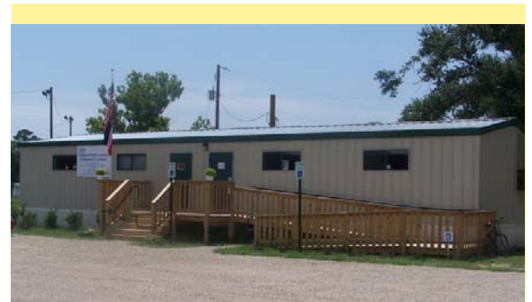
Gulfport Temporary Library

Our needs are, of course, enormous. Not only did we lose some of our buildings, but we also lost at least 180,000 books, DVDs and audio tapes. Additionally, we lost more than 100 computers and a variety of furniture items. My personal estimation is that it will cost something in the neighborhood of $25,000,000