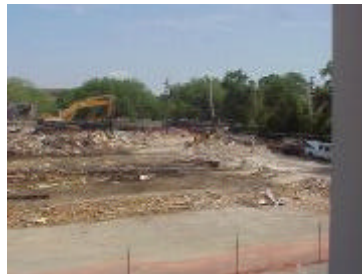
April 29, 2003