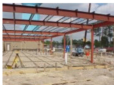
April 17, 2003