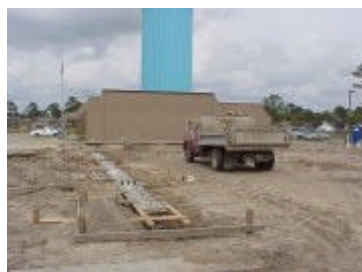
March 25, 2003