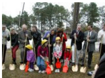
December 10, 2002