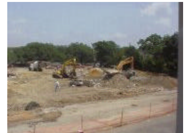
May 7, 2003