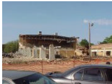
April 23, 2003