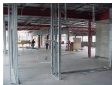
May 8, 2003