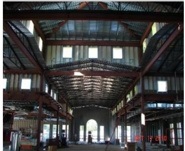
Inside view of new library in Biloxi, Oct 2010 Opening 2011