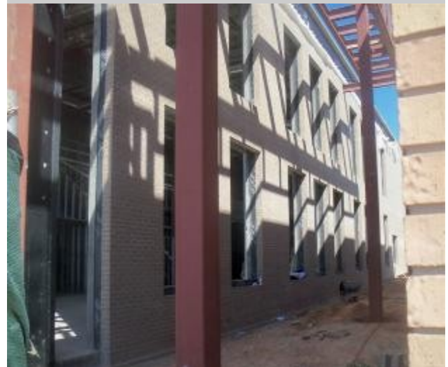
Exterior view of the new Downtown Gulfport Library Opening 2011