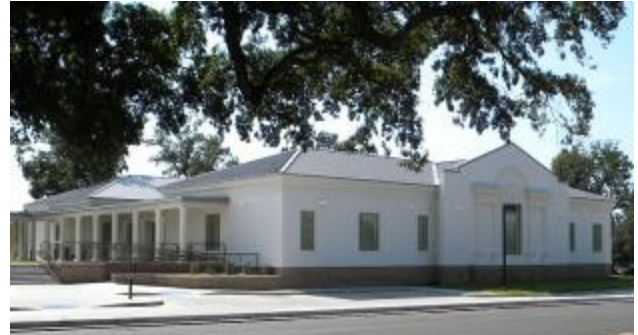
The new Pass Christian Library opened its doors the Summer of 2010.